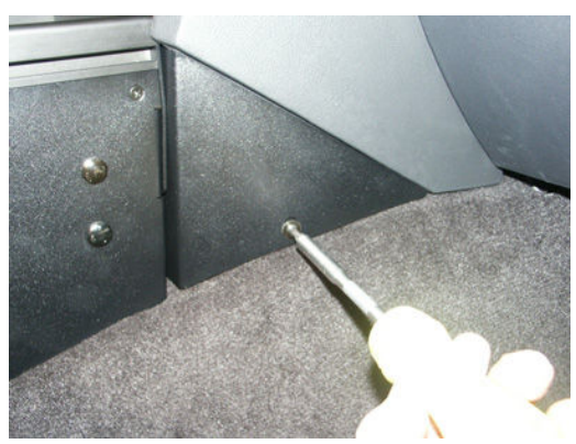
Attach driver and passengerside wire panels (#7 & 8) to frame support bracket using #10 x ½" phillips machine screws and washers.